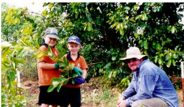
Green Corps and school children plant trees

This three year project will continue until the end of the financial year 1999/2000. Greening Australia has been developing training workshops for the staff of landowners and managers with the aim that they will take over management of the revegetation areas themselves. As a result, the final year will focus on training the stakeholder land managers in best practice vegetation management techniques. In April 2000 Greening Australia provided all landowners and managers with copies of the Rapid