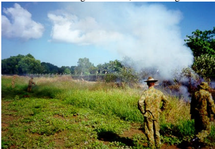
Defence personnel carry out controlled burns

In addition to the on-ground work, a fire management forum was conducted by Greening Australia