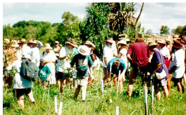
Members of the public inspect revegetation work