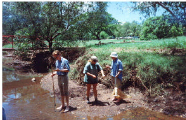
Waterwatch staff training Green Corps

encouraged them in their work. The Committee requested that the Department of Lands, Planning and Environment initiate discussions between themselves and the Waterwatch network on the roles of Waterwatch and the Committee and how data from the reports should be used.