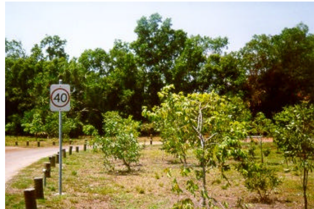
Revegetation work at Charles Eaton Drive

Greening Australia continued to coordinate the on-ground work for the Rapid Creek Integrated Catchment Management Project. This was the second year of the project, which is supported by the Natural Heritage Trust and is administered by Defence. The project aims to increase the extent of natural plant communities by strategically revegetating areas. It also aims to reduce the density and extent of weed invasions in and adjacent to remnant native vegetation.